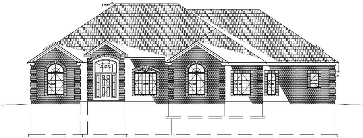
1 FRONT ELEVATION A-1 SCALE: 1/4"=1'-0"